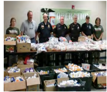
Drug Take-Back Event

To dispose of prescription and over-the-counter drugs, call your city or county government's household trash and recycling service and ask if a drug take-back program is available in your community. Some counties hold household hazardous waste collection days, where prescription and over-the-counter drugs are accepted at a central location for proper disposal.