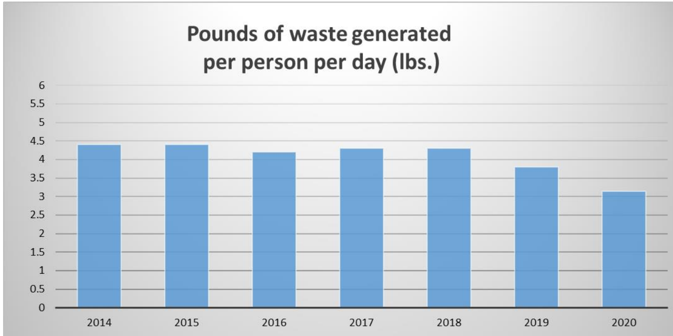
Graph 2: Per capita landfill rate (ppd)

Graph 2: Indicates the County’s per capita landfill rate 2014 – 2020. In 2020, the County generated 3.14 pounds of waste per person per day (PPD). This is a decrease from 2019, which was 3.8 ppd.